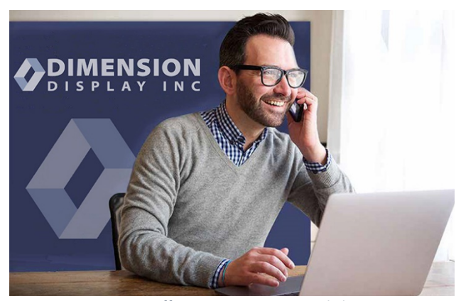
Home Office Environment Backdrop for video conferencing